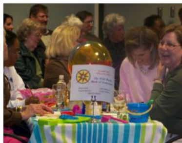
The Carolina Girls of the Bank of Anderson enjoy their time at the Bee.