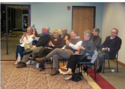
Members of the audience cheer for their favorite team: Anderson County Library, Anderson University, Bank of Anderson, Blue Ridge Electric, Carolina Cardiology Consultants, The M&Ms, The Peoples Bank, The Spellbound Team, & Wachovia Bank.

Many thanks to those of you who have joined the Friends or renewed your memberships over the past few months. Joining is easy! Minimum dues are only $5. Pick up a brochure at a library today!