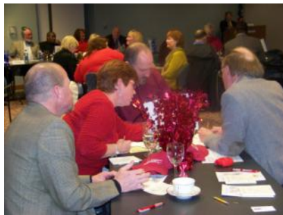
The Carolina Cardiology Consultants team confers. One to three points were awarded for correctly-spelled words.